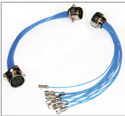
▲ Fig. 2 SSBP high performance coax contacts for use in standard MIL-DTL-38999 and other multiport connectors solve the space, weight and performance challenges of standard interconnect cabling.

in off-the-shelf multiport connectors that use M39029 contacts. For maximum design flexibility, SSBP contacts for special applications, including discrete coax installations, can be arrayed in custom envelopes. Seating or removal of SSBP contacts is achieved using standard MIL-I-81969 insertion and extraction tools.