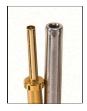
SSBP - 20