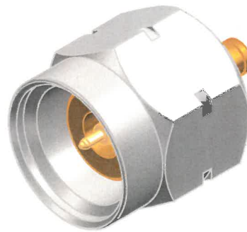
CABLE TERMINATION END