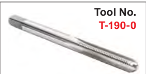
Tool No. T-190-0