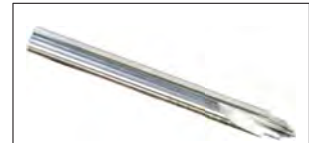
Counter Bore Tool (Tool No. Below)